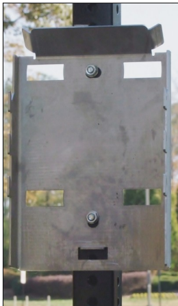
The back pole mount bracket attaches permanently to the pole. All screws and nuts are covered when the radar sign is attached.

Please note that multiple back brackets will need to be purchased depending on the number of pole locations you have. For example, if you have two radar signs and five poles, you will need five back pole brackets and two front brackets. In this example, you would need three additional back brackets.