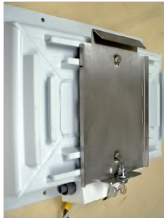
The front bracket attaches permanently to the radar sign.