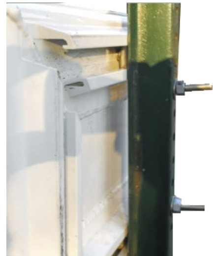
Sign mounted on U-channel pole with flat bracket