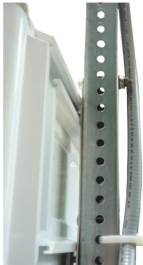
Sign mounted on 2x2 pole with flat bracket