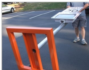
One-person operation to tilt and roll to a new location