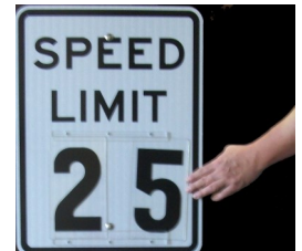
Interchangeable Speed Limit Display Option