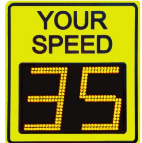
School Zone (shown with TC-600)