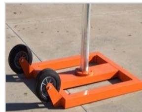
Angled wheels ensure stability and easy-tilt when ready to move