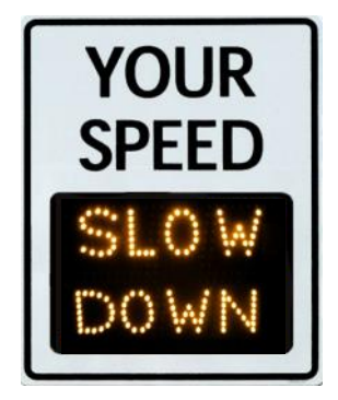
TC-1000 with 17" LED display