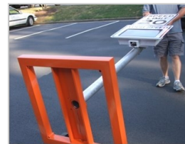
One-person operation to tilt and roll to a new location